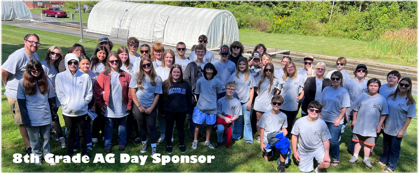
8th Grade AG Day Sponsor