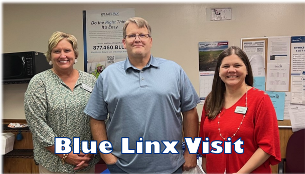
Blue Linx Visit