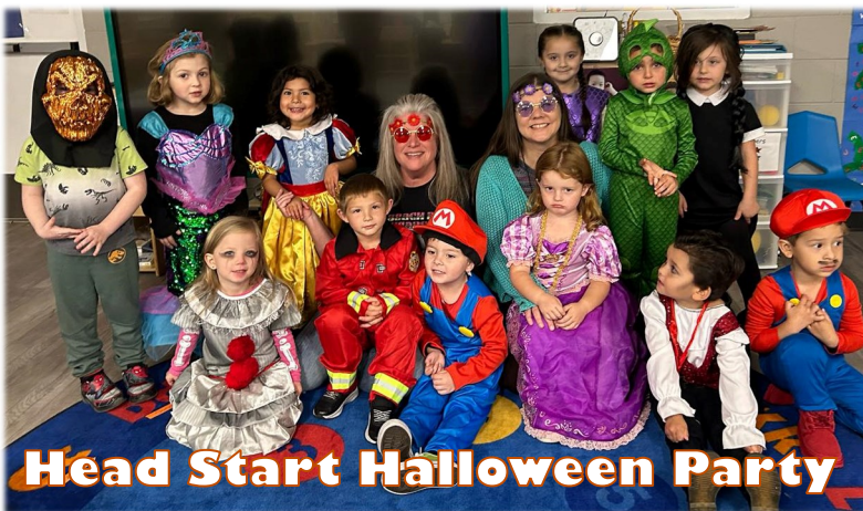
Head Start Halloween Party