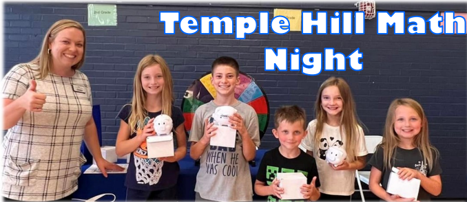
Temple Hill Math Night

What makes Clinchfield FCU different? This! We are honored to be able to help and participate in so many activities in our community because of you, our members! Thank you for your membership and the opportunity to serve you and our community.