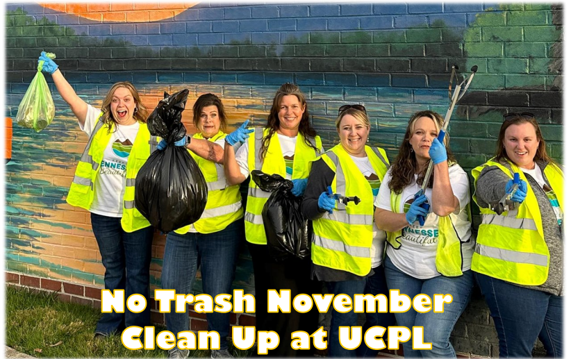
No Trash November Clean Up at UCPL