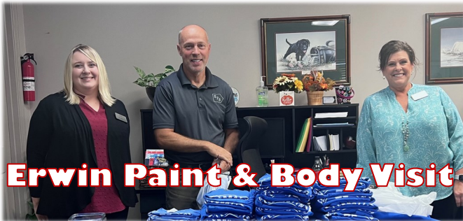
Erwin Paint & Body Visit