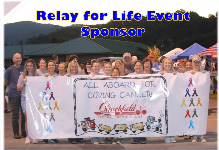
Relay for Life Event Sponsor