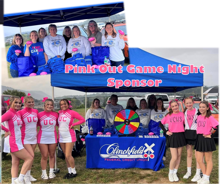
Pink Out Game Night Sponsor