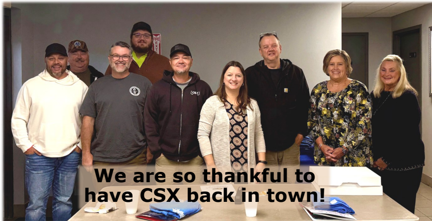
We are so thankful to have CSX back in town!