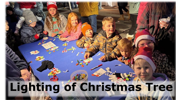
Lighting of Christmas Tree