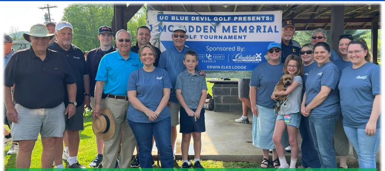
2nd Annual J. McFadden Memorial Golf Tournament