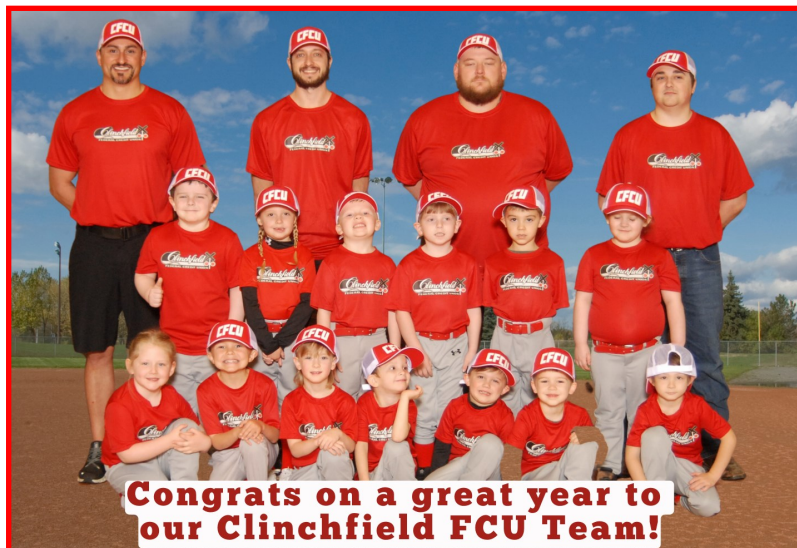
Congrats on a great year to our Clinchfield FCU Team!