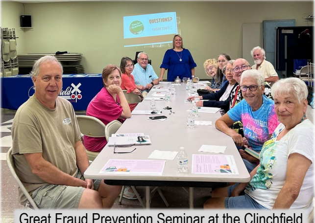
Great Fraud Prevention Seminar at the Clinchfield Senior Adult Center.