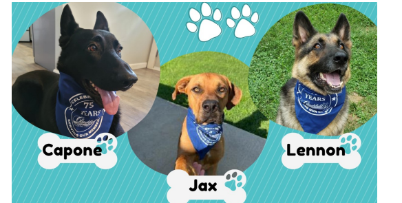
International Dog Day: Just a Few of the Dogs of Clinchfield FCU