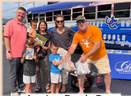
Aspire Book Bus