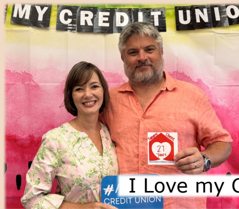
# I Love my Credit Union Day!