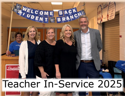
Teacher In-Service 2025