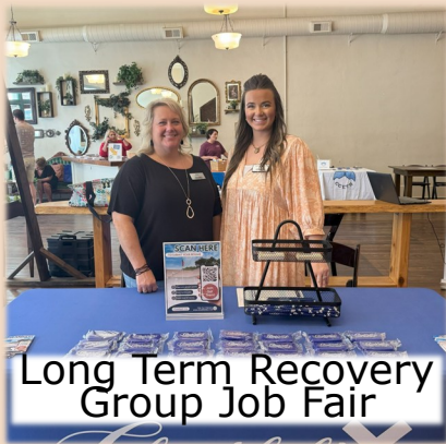
Long Term Recovery Group Job Fair

When you finance local, you are also supporting local! We are thankful to be able to support our members & community with sponsorships, financial education, & giving back!