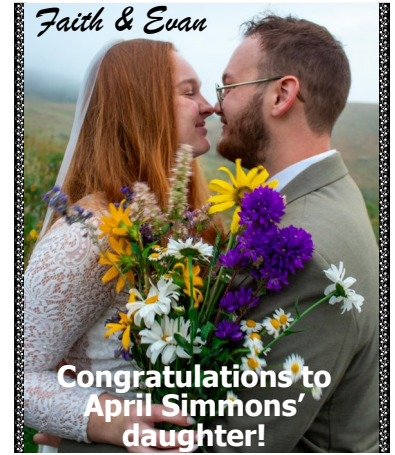
Congratulations to April Simmons' daughter!

When you finance local, you are also supporting local! We are thankful to be able to support our members & community with sponsorships, financial education, & giving back!